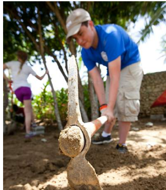
Learn how pineapples are grown and harvested at a plantation in San Francisco de Macorís.

Collaborate and learn with scientists, engineers, researchers, and other STEM practitioners in the field.