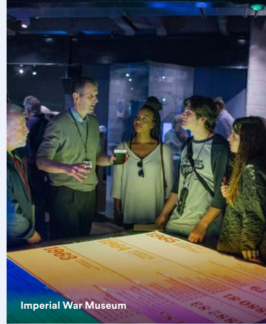
Imperial War Museum