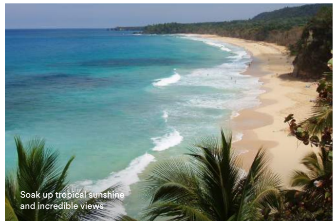
Soak up tropical sunshine and incredible views