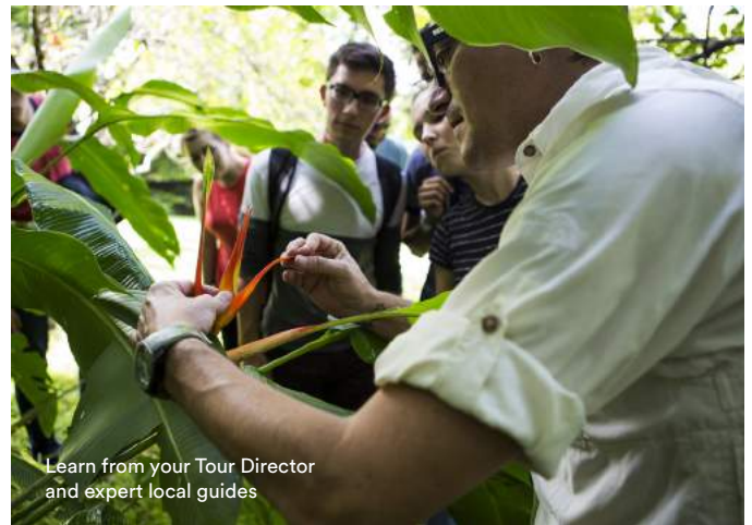
Learn from your Tour Director and expert local guides