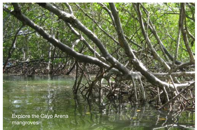
Explore the Cayo Arena mangroves