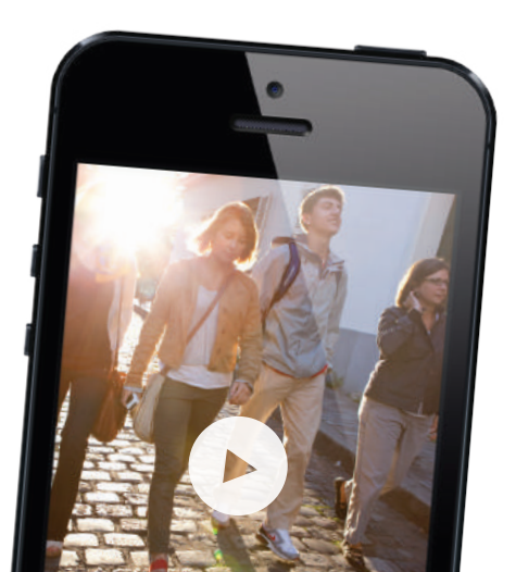
CHECK OUT WHAT A TOUR IS ALL ABOUT