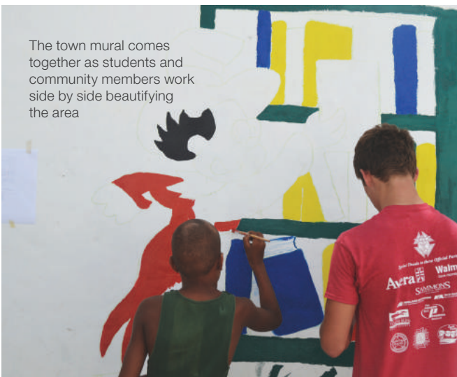
The town mural comes together as students and community members work side by side beautifying the area