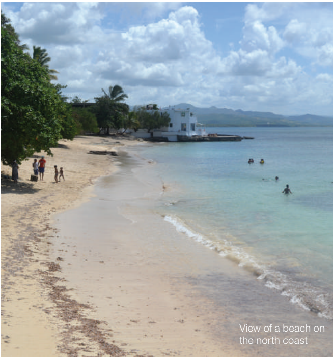
View of a beach on the north coast