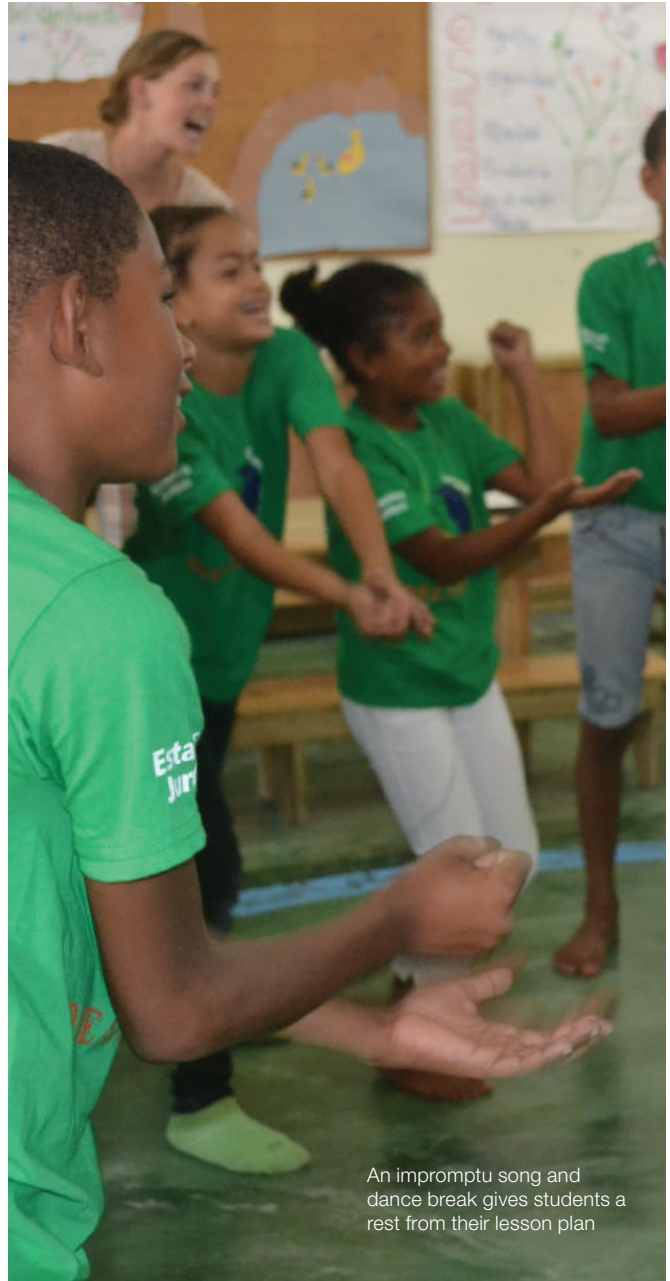
An impromptu song and dance break gives students a rest from their lesson plan