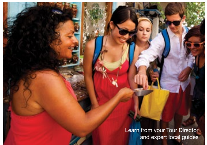
Learn from your Tour Director and expert local guides