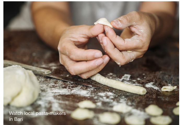
Watch local pasta-makers in Bari