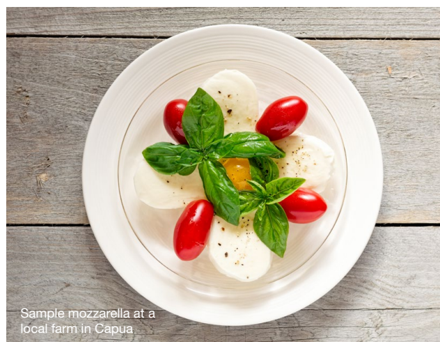
Sample mozzarella at a local farm in Capua

All of the details are covered: Round-trip flights on major carriers; Comfortable motorcoach; 8 overnight stays in hotels with private bathrooms; European breakfast and dinner daily