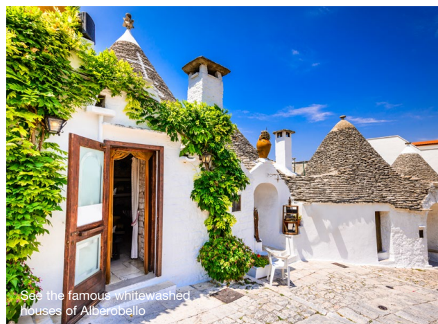
See the famous whitewashed houses of Alberobello