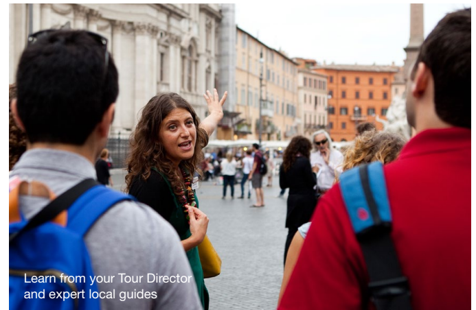
Learn from your Tour Director and expert local guides