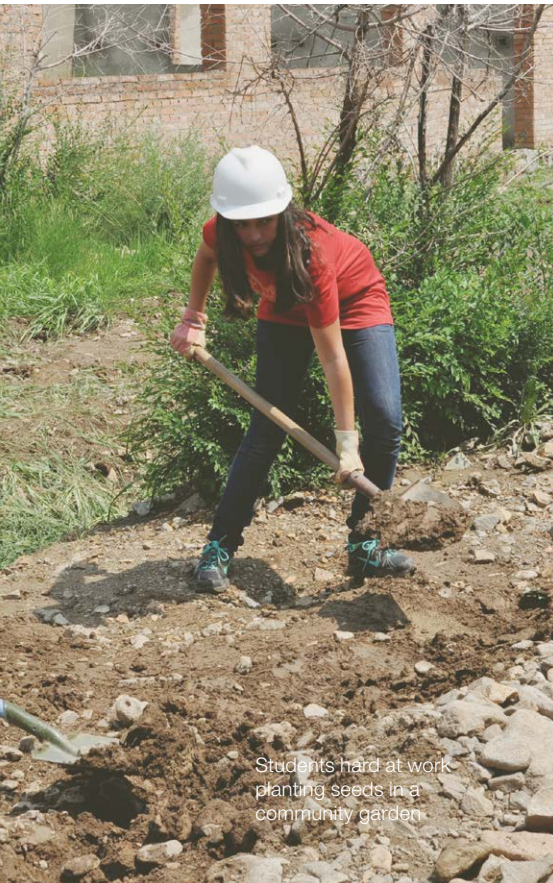
Students hard at work planting seeds in a community garden