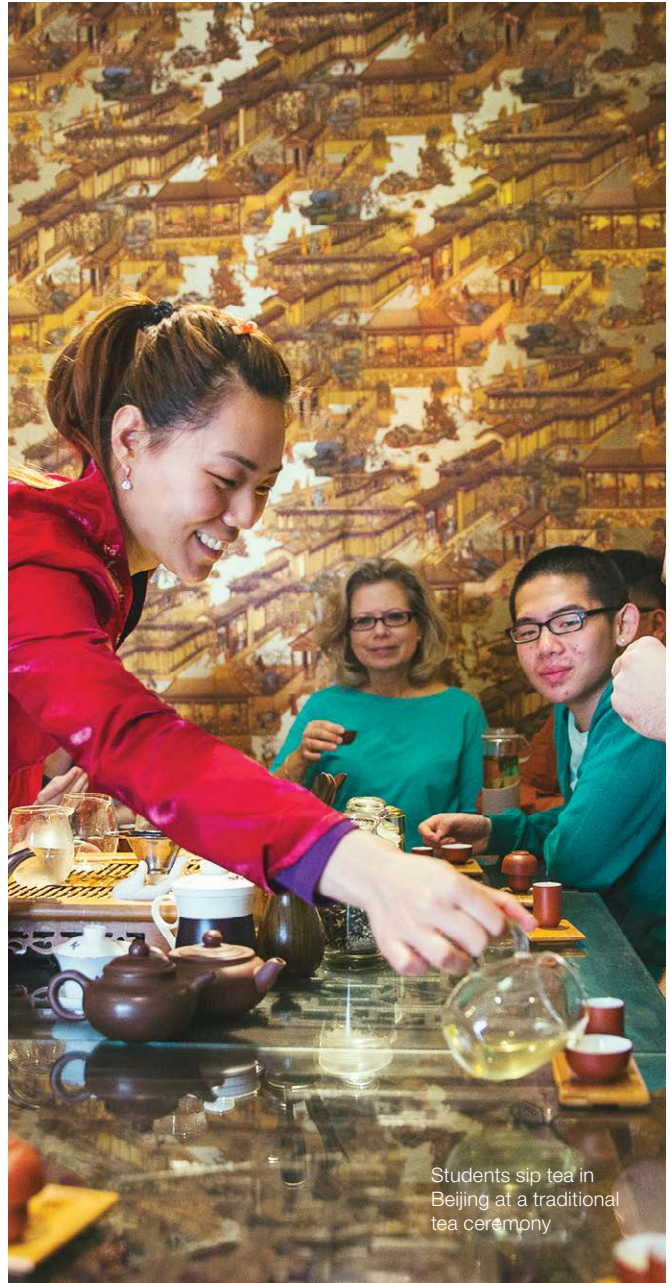
Students sip tea in Beijing at a traditional tea ceremony