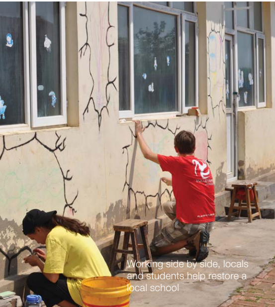
Working side by side, locals and students help restore a local school