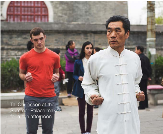
Tai Chi lesson at the Summer Palace makes for a zen afternoon