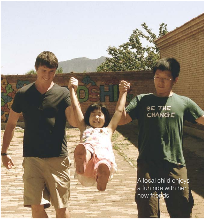
A local child enjoys a fun ride with her new friends