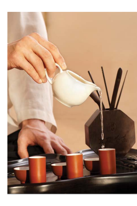
Participate in a traditional tea ceremony on day 3