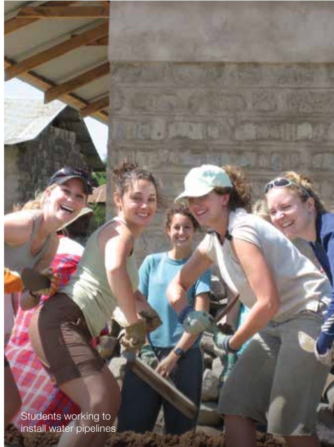
Students working to install water pipelines