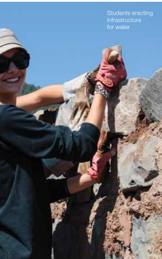
Students erecting infrastructure for water