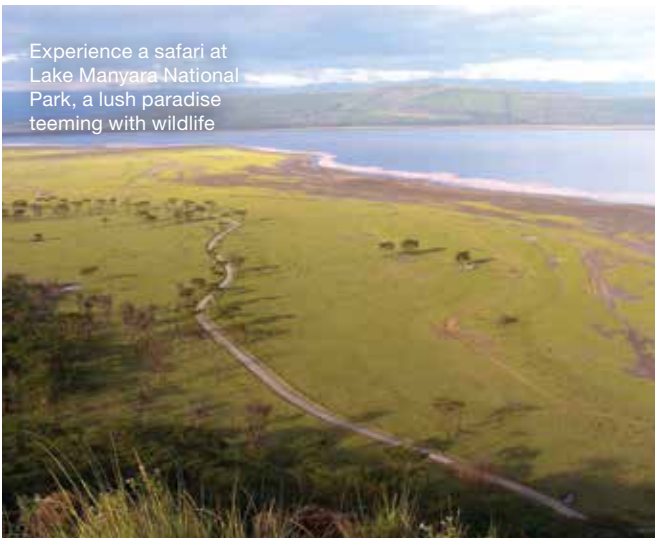
Experience a safari at Lake Manyara National Park, a lush paradise teeming with wildlife